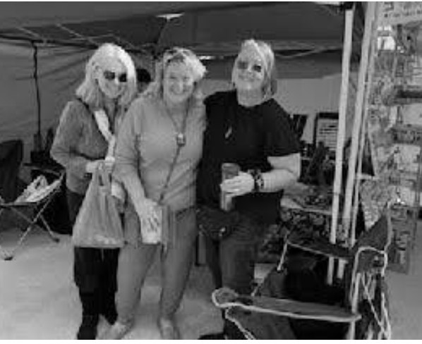
RIGHT—Our Arts and Crafts Fair in was PACKED. Looks like some happy shoppers!