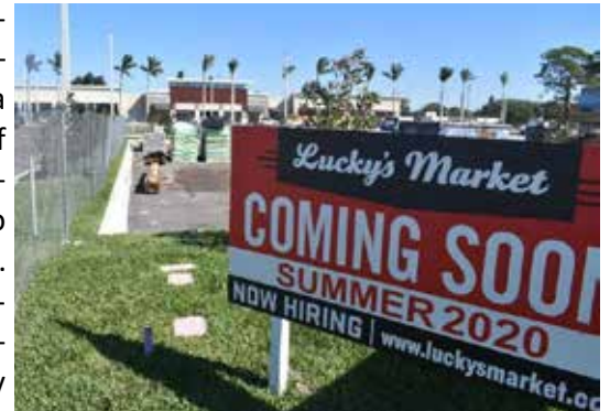
Lucky's Market signs are remain up — but construction appears to have stopped. (Aldi's may take the space)

To everyone's great disappointment, the long-anticipated opening of a Lucky's Market at the site of the former K-Mart at Shamrock and US41 is expected to close before it even opens. Construction was near completion, but the company announced last week that they are closing their Florida stores. The one in Sarasota is closing February 12, so things are moving fast.