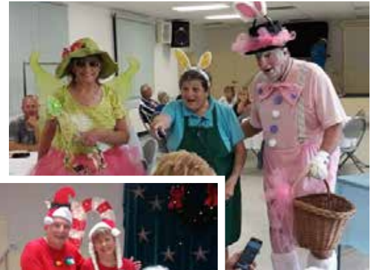
The kids loved our holiday breakfasts in 2019!

Thank you for your support and we look forward to bringing you