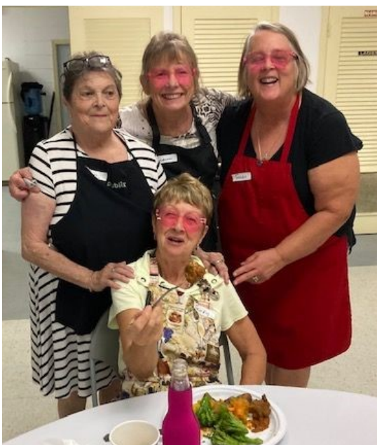
A great evening at the Association on February 18, celebrating all the volunteers who worked on this year's hugely successful Yard Sale.