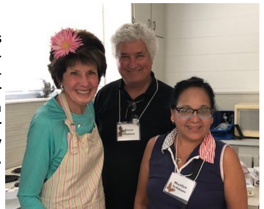
Garden Club's media rep, treasurer and Refreshments Chair in the kitchen getting ready for the February gathering.

March 5 will be our annual Plant and Rummage Sale. We'll have experienced gardeners on hand to advise attendees about the plants for sale. And there's rummage too, including clothing, household items, books and some furniture. Join us and let's keep beautifying South Venice with Florida-friendly, native plants.