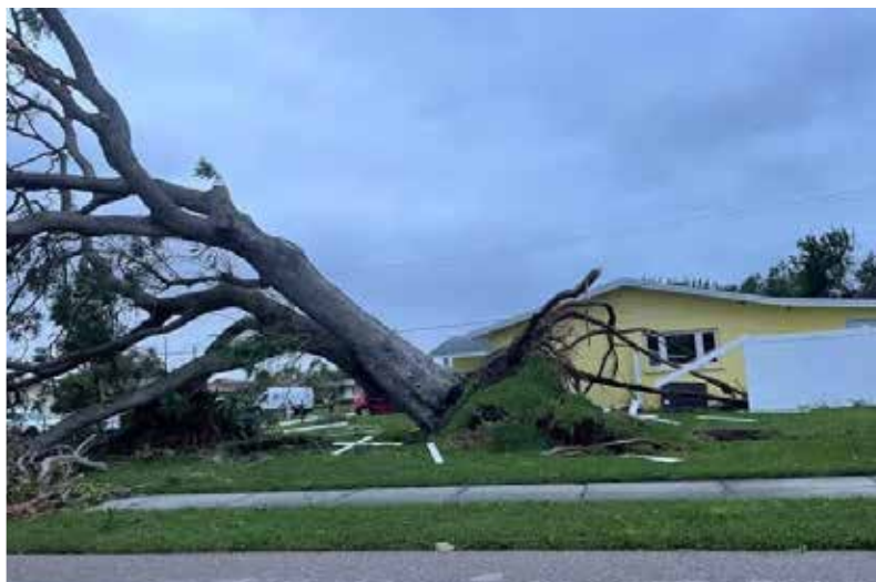
Just another image from our neighborhood. Familiar?