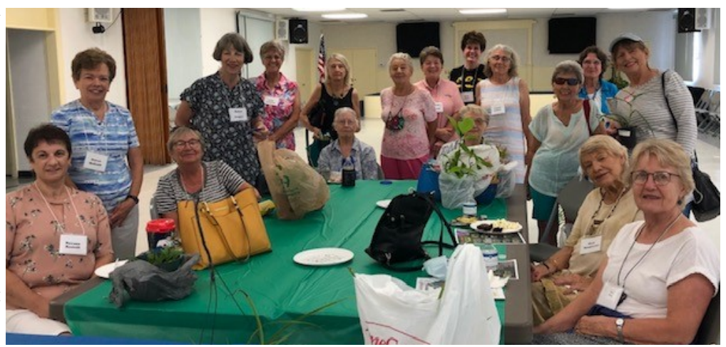
Twenty-two were at the September Garden Club meeting. It was great to resume in-person meetings!

what a wonderful start of our 2021- Please mark our next meeting on your calendar - October 2022 season it was! We'll be meeting at 1:00pm on the 18 at 1:00pm and plan to join us as we learn and share our experiences of gardening in Paradise! We'll be putting out some of our newly created signs around the neighborhood the day before—look for them!