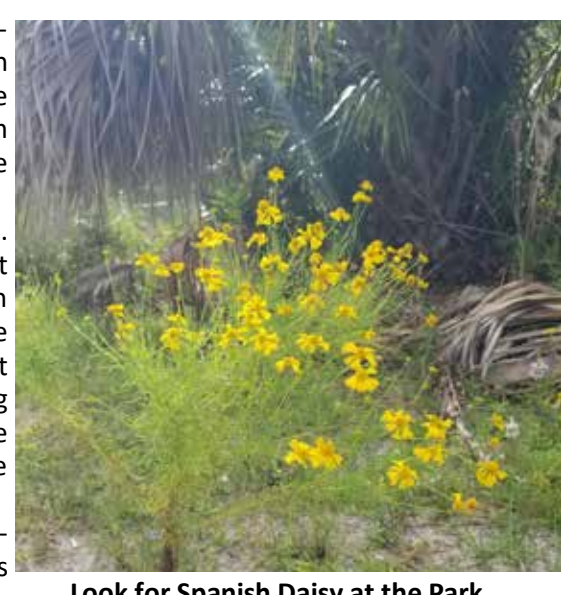
Look for Spanish Daisy at the Park

plant's beautiful, pinkish flowers are in full bloom along the Shamrock Park trail. The fragrant flowers can often be smelled just walking along the path. The flowers attract multiple species