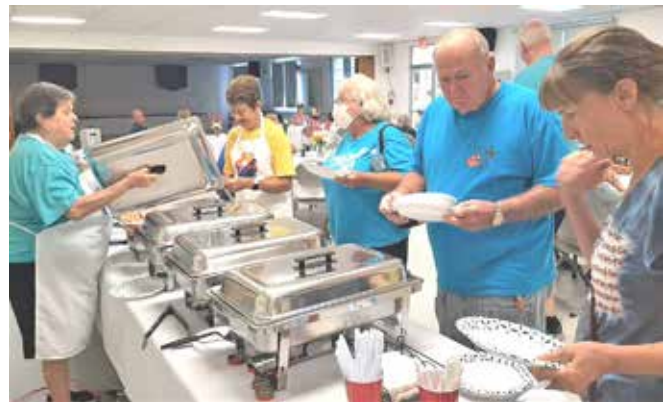
Lining up at September's Pancake Breakfast.

He may have had a hard time reaching the table, but he ate THE WHOLE THING!