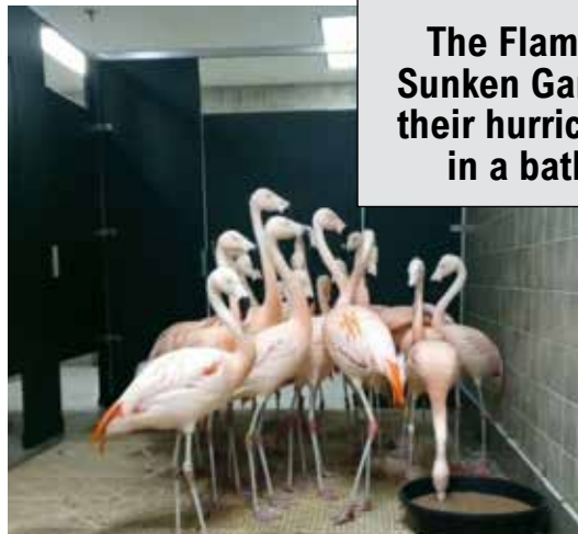
The Flamingos at Sunken Gardens had their hurricane party in a bathroom.

For 67 years, the SVCA has been here for South Venice, for YOU!