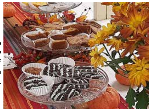
Cherry Giovinazzo laid out a very tempting choice of yummys to go with our coffee.