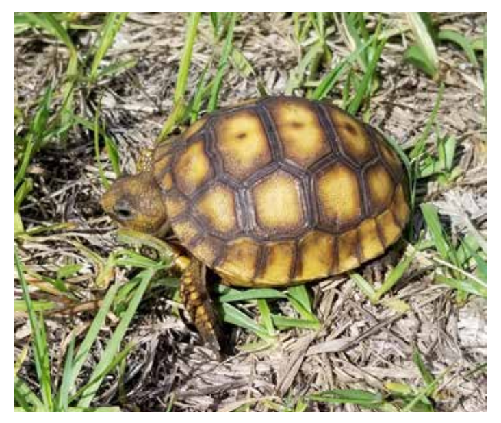
A baby tortoise makes its way through the grass

these guidelines while visiting the park. This time of year, it is also important to be aware of the dangers of overheating!