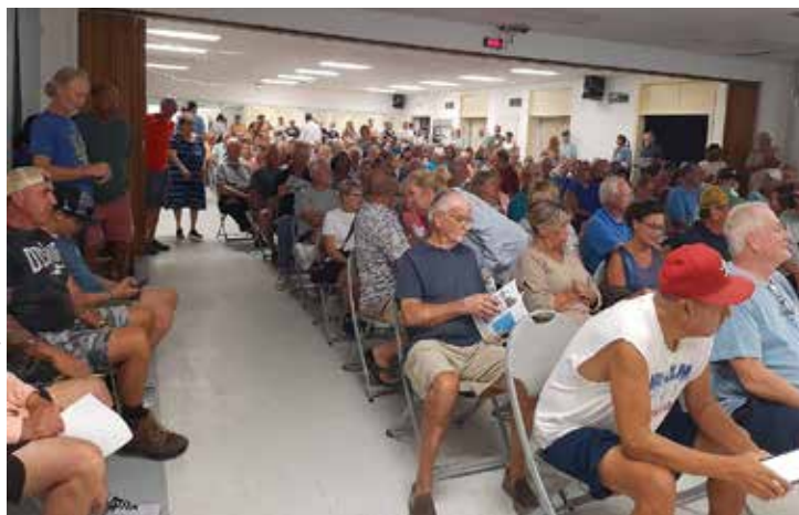
In February, the hall was full to hear an update on conditions at the beach post-Ian—and plans going forward.