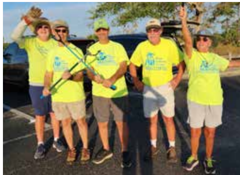
Though the faces change as neighbors come and go, SVCA's Trash Buddies and others who keep our civic improvement projects going will always have our thanks.

was part of the True Blue Bloodhounds program which trains bloodhounds to assist police in locating individuals who may be lost or who may have committed