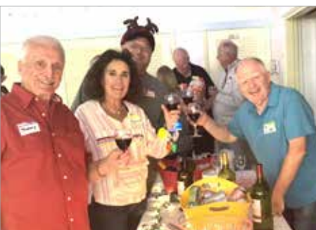
Lots of good cheer at December's Wine & Cheese Social

We did not cancel our October meeting even though the Wildlife Center was not able to come. We used this time