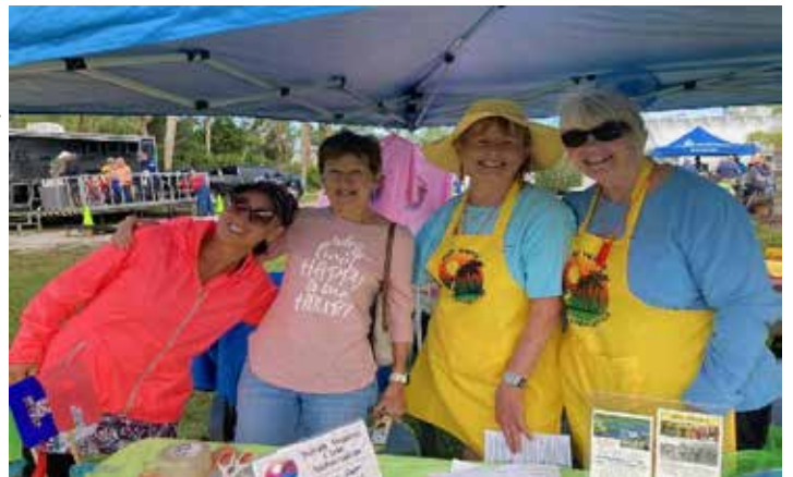
The SVCA booth at Alligator Fest

theft. We came away much more aware of how to keep our identity safe and our money from those attempting to take it away.