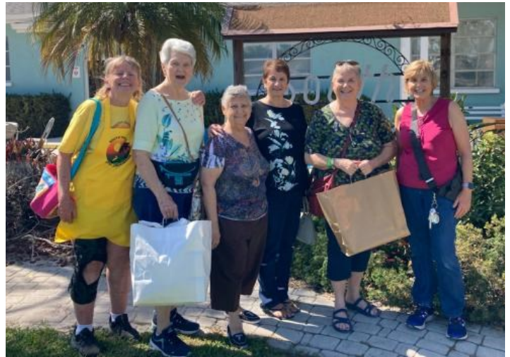
Shoppers looking happy at our Neighborhood Flea Market. And it looks like these two enjoyed the Pumpkin Painting Party!