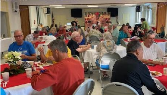
Lots of happy families came for Breakfast with Santa