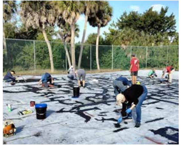
In February, volunteers began the preparation work on the old courts.

In December, a small group of SVCA members came together to explore the possibility of converting the old and unused basketball courts behind the SVCA into pickleball courts. The SVCA Board then held a joint exploratory meeting on December 14 to hear a presentation of the proposal.