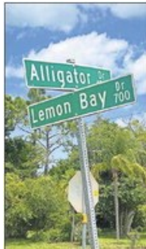
The property is adjacent to or along both Lemon Bay Drive as well as Alligator Drive.