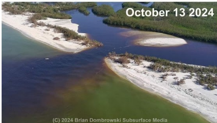
October 13 2024