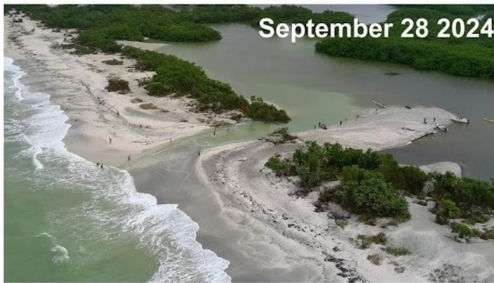
September 28 2024